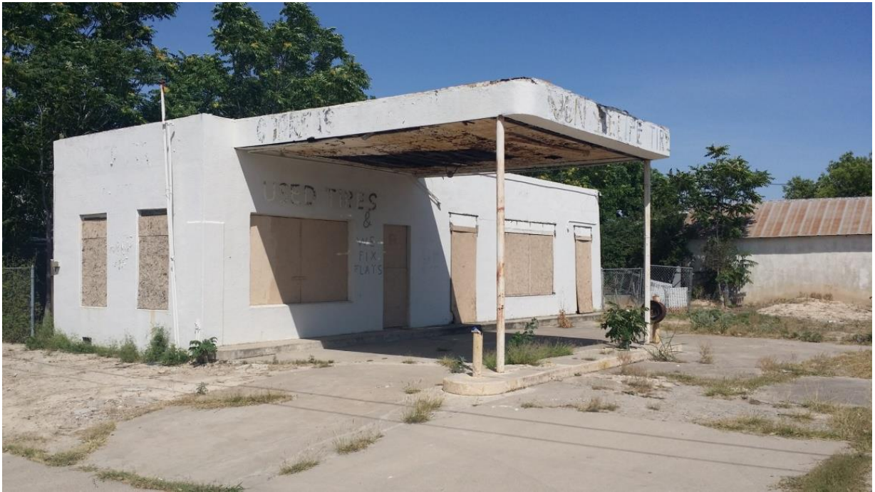
212 West Chapoy Street- Year/2019 - Del Rio, Texas, U.S.A.

301 East Garfield Street, Suite B- Del Rio, Texas 78840 - ajfalconart@gmail.com