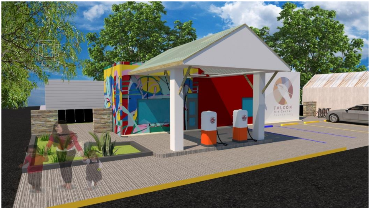
Future Falcon Art Center Foundation -3-d rendering- day time- future - Del Rio, Texas, U.S.A.

301 East Garfield Street, Suite B- Del Rio, Texas 78840 - ajfalconart@gmail.com