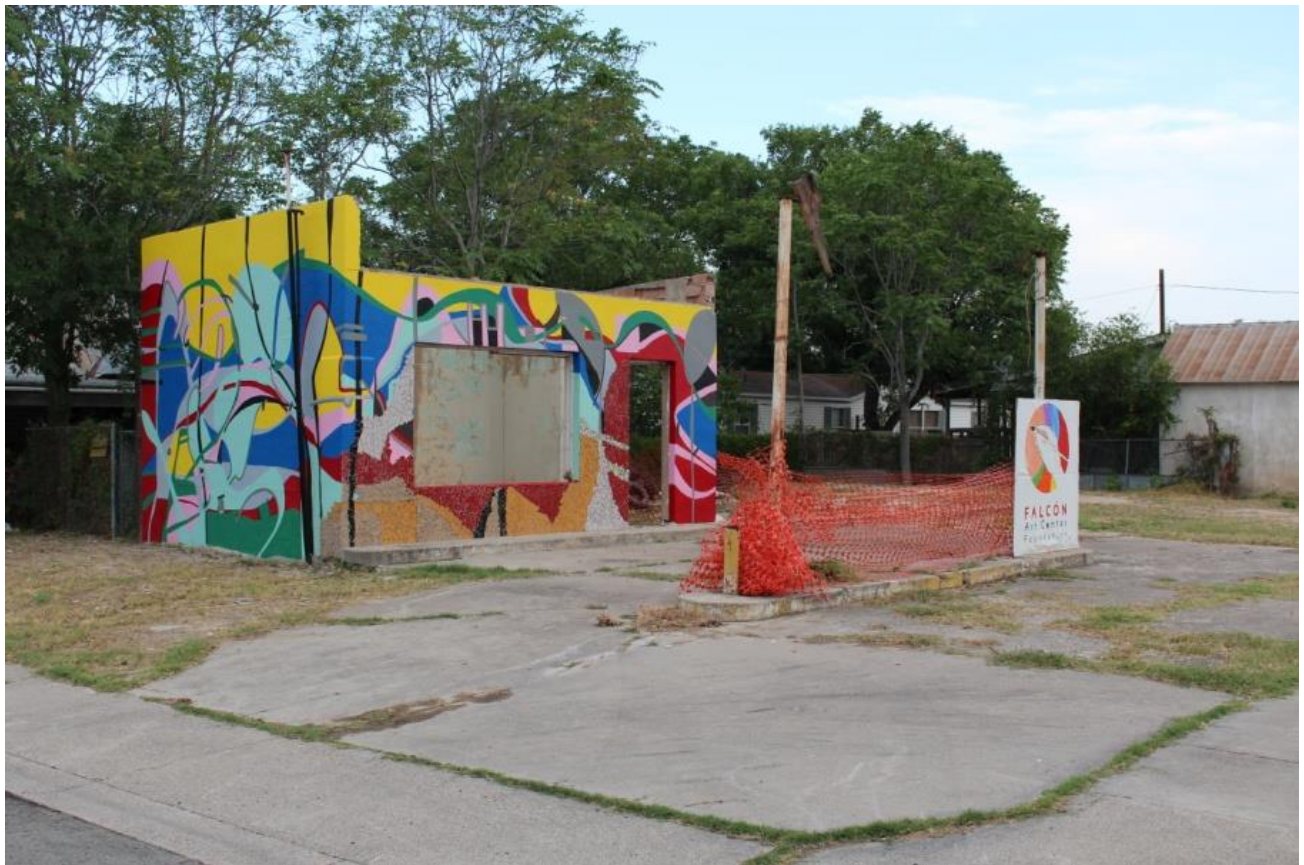
Mural: Handmade 100 Percent- Year/2020-Del Rio, Texas, U.S.A.

301 East Garfield Street, Suite B- Del Rio, Texas 78840 - ajfalconart@gmail.com