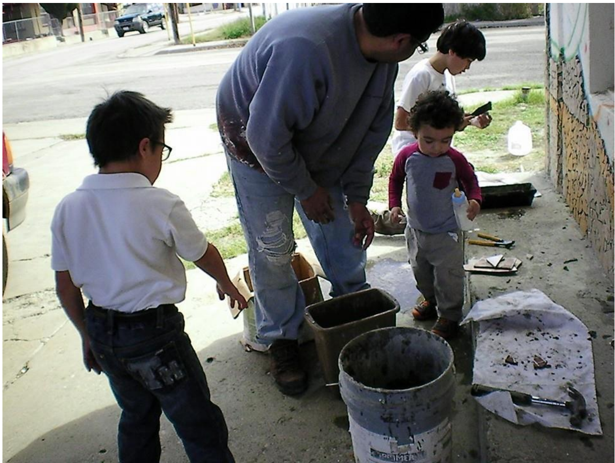
Kids helping with the mural - Year/2015-Del Rio, Texas, U.S.A.